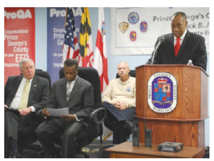
Rep. Steny Hoyer, Co. Exec. Jack Johnson, PSC Dep. Dir. Wayne McBride, and Pub. Safety Dir. Vernon Herron were among many officials who attended the official launch of the county's new public safety radio network on Dec. 7, 2009.

The trunked system is intended for use by public safety agencies only. Schools, public works, etc. will remain on existing radio systems.