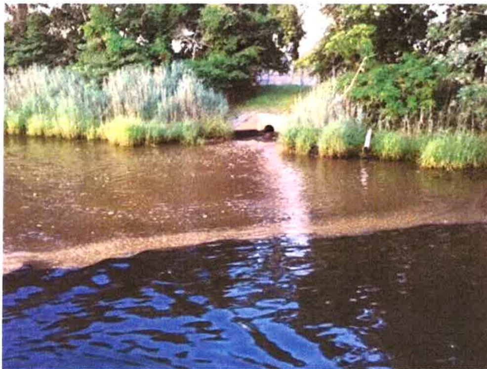
Rehoboth Beach WWTP Outfall 001 – Photos Taken July 10, 2016 @ Approximately 2015 hrs.